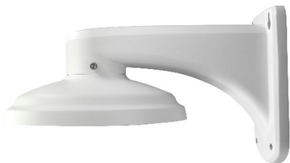
WB88 Junction Box